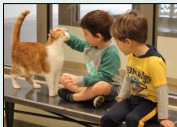
Lynchburg Humane Society!