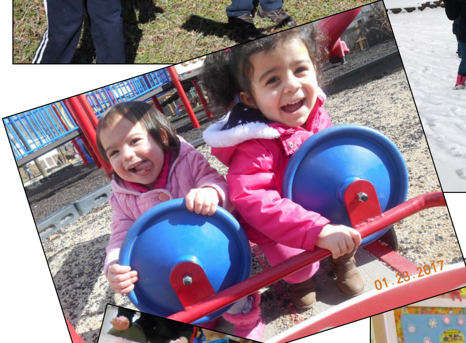
Snow Ball Painting & Art! Playground Fun! Flying Kites!