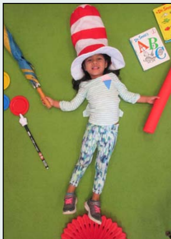
Dr. Seuss Birthday Party!