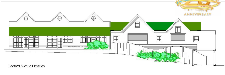
Rendering of the EELC 20th Anniversary Classroom Project. The section on the right will be added to the existing building on Bedford Avenue.