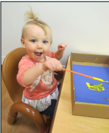
Having Fun and Working on our Fine Motor Skills with Art!