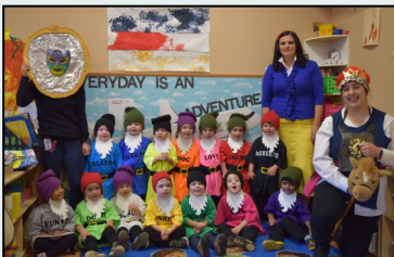
Betts Station as Snow White & Seven Dwarves for Halloween!