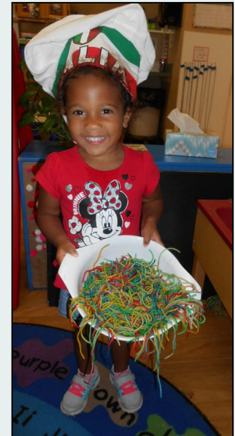
Learning about the Different Cultures of our Classmates!