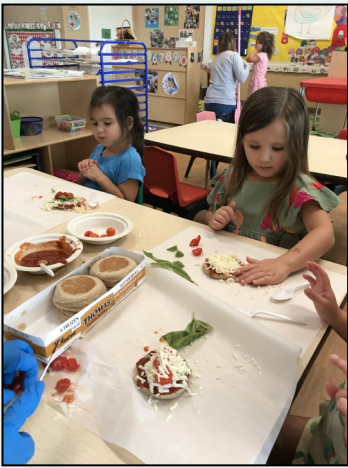
Making Pizza with Basil and Tomatoes that we Planted in our Vegetable Garden!