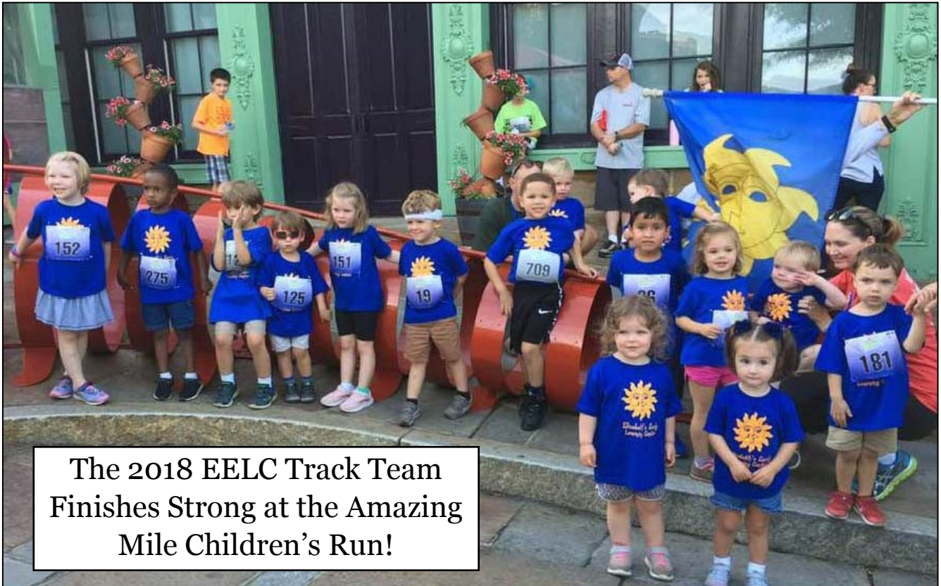
The 2018 EELC Track Team Finishes Strong at the Amazing Mile Children's Run!