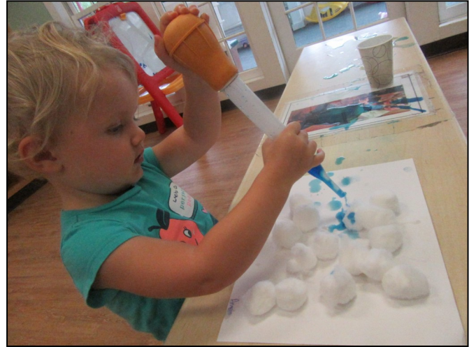
Learning about Rain Clouds