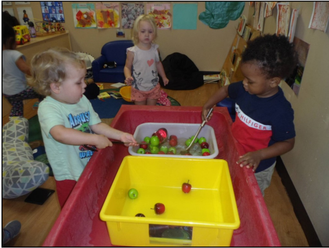
Apple Bobbing with Ladles to Develop Fine Motor Skills