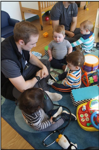
PA Students Listening to Our Hearts

Physician Assistant students from the University of Lynchburg visited EELC, as part of their study of pediatrics, to observe child development and to practice their clinical skills with children. They planned lessons to teach children about health and they checked heartbeats and ears. The children also enjoyed learning about the tools used by medical professionals to keep them healthy.