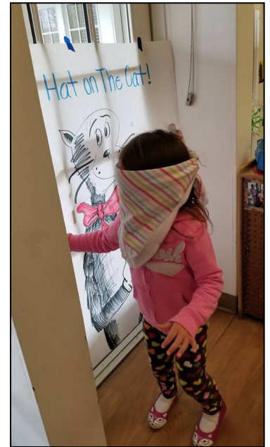
Playing Pin the Hat on the Cat & Learning about the Author, Dr. Seuss