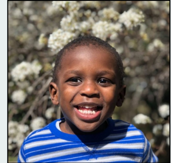
It's All Smiles at EELC!