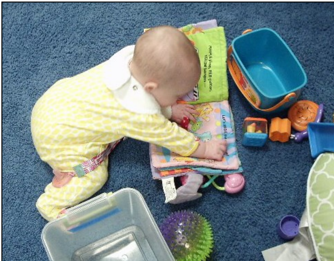
Learning about Books