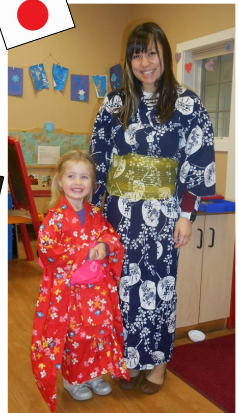
Wearing Kimonos from Japan!