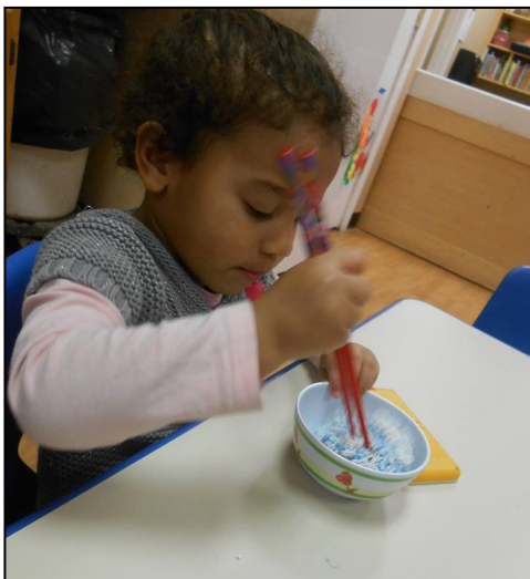
Trying out Chop Sticks!