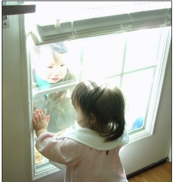
Communicating through Hand and Eye Gestures