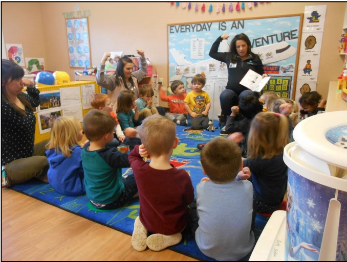
Parents Read to Us