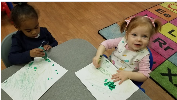
Learning to Write