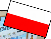
Building the Wawal Castle in Poland!