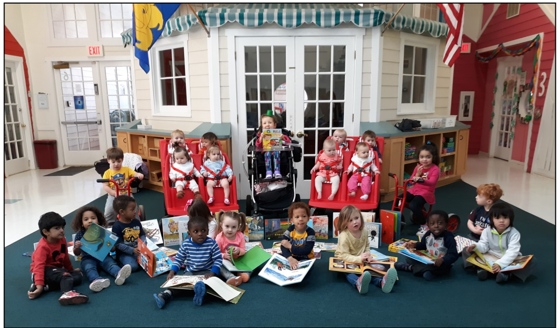
EELC Children with the Bikes, Books and Buggies that Our Giving Tuesday Donors Made Possible at EELC!

Giving Tuesday, the Tuesday after Thanksgiving, is a global movement in which millions of people come together to support and champion the causes they believe in and the communities in which they live. Last November, EELC participated in Giving Tuesday to raise funds for our program. Donors were generous and we exceeded our goal of $5,000.00. We were able to purchase new tricycles, buggies for our new infant classrooms, and books for our lending library. Did you know that, each week, approximately 140 books are checked out of the EELC library for students to take home and read with their parents? Our book dollars stretched even further thanks to a generous discount from Little Dickens. Thank you to all of our donors and supporters!